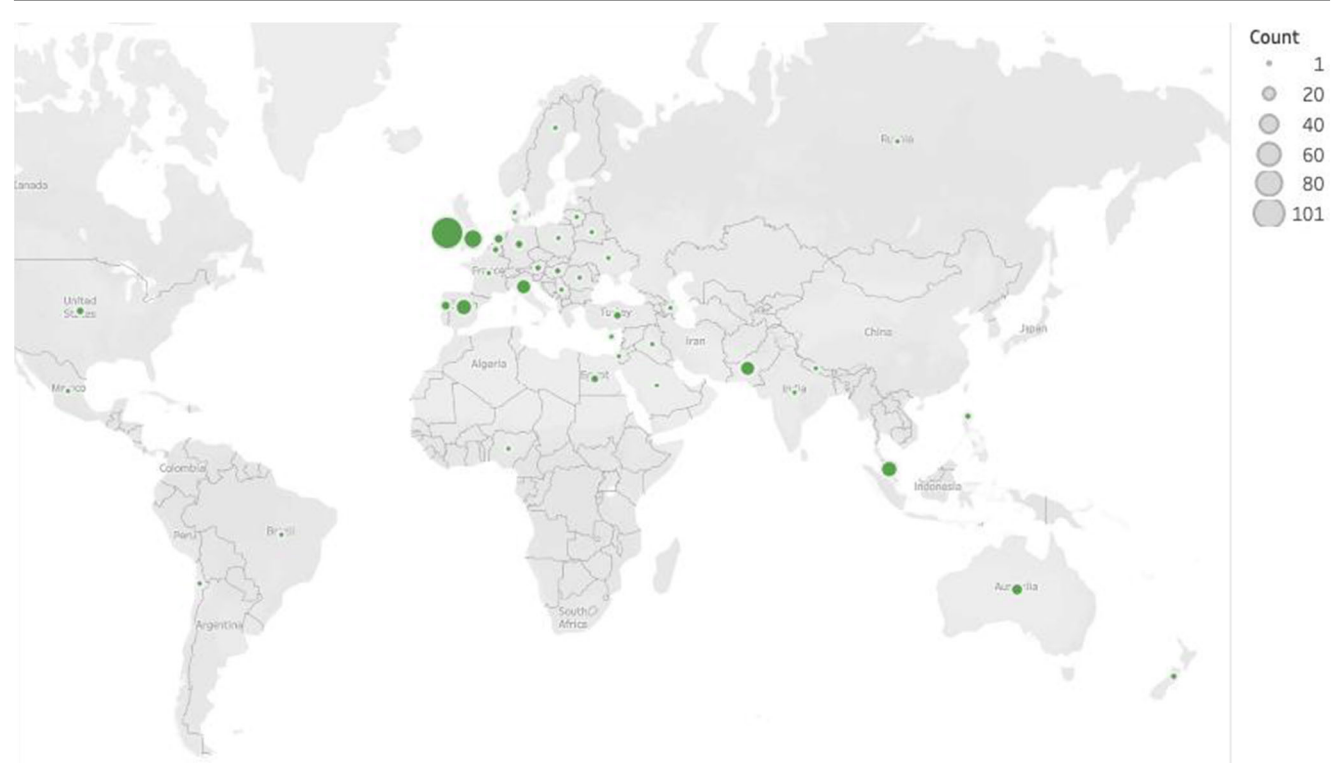
Fig. 1 Geographical location of participants

therapy post-operatively for acute uncomplicated appendicitis (21.4%, n = 62/290) (Table 3).