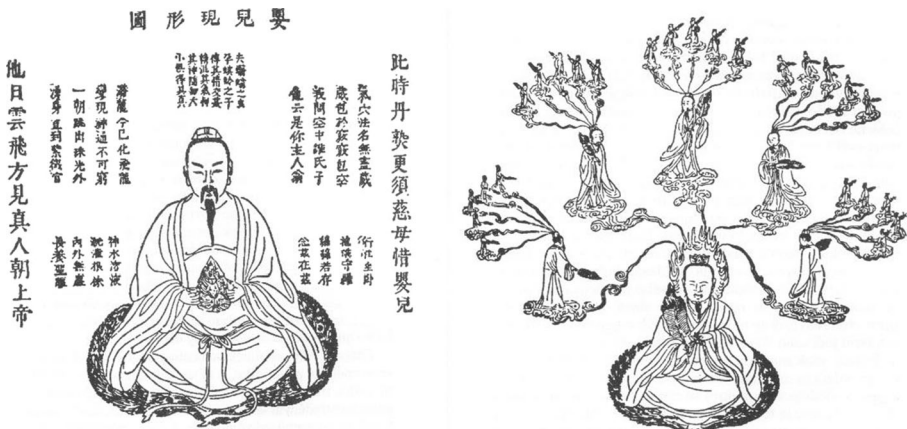
Awakening chakra energies in Taoist spiritual practice

For example, in Taoist text Tchaj-I T'in-chua Cung-C' that Wilhelm translated (Jung and Wilhelm 2004, pp. 57–65) are chakras, and one of them corresponds to the Manipura chakra and the other correlates to Sahasrara chakra in Yoga. The first representation is explained in the Taoist text by the comment that it is 'rebirth in the space of energy'—therefore activation of the first chakra. The second representation is explained as 'awakening of the spiritual body to start independent existence.' There is also a different name of this representation—'Golden Flower.' Looking at a depiction of the 'Golden Flower', we can certainly assume that this is beyond the body—a transcendent form of existence.