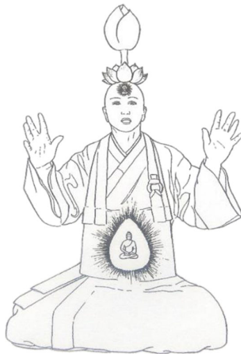
Mystical death of Jiyu-Kennett. During the opening of the ‘third eye’ for awhile she died

Zen-Buddhist Jiyu-Kennett describes kundalini energy and chakras in a great detail. She (Jiyu-Kennett 1997, pp. 67–144) practiced Zen-Buddhist meditation technique and was gradually activating these energies and chakras until they were fully awakened. She took notes and drew pictures of the progress—her descriptions show that this awakening of energies was also experienced by other monks that practiced meditation. We know about her private—or subjective—experiences that were linked with her life, Buddhism, and also the Christian religion, and we also know about her objective observations of activating energy in the case of both the monks and also herself. Reading from her drawings, we may say that awakening chakra energies can expand our consciousness, but also free it from the body. When she was activating the 6th chakra, Jiyu-Kennett freed her mind from her body; we can call this ‘mystical death’. She (Jiyu-Kennett 1997, p. 76) described the phenomenon of mystical death in this picture: