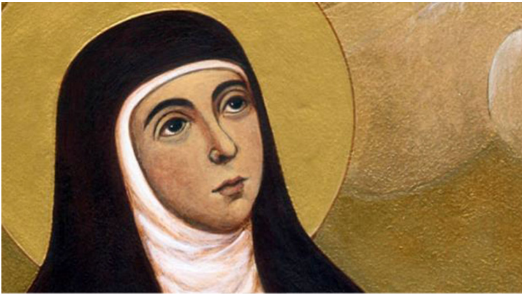
Saint Teresa of Ávila with golden aura around the head—this resembles the Sahasrara chakra

We believe that a principle similar to the above-mentioned spiritual traditions should also be valid for Christian mysticism. This means that the awakening of the kundalini and chakra energies is a condition for expanding awareness and insight into being; this is defined as the unity of the soul with God (lat. unio. ) in the Christian religion. As a result of dualism of the soul and body in the Western Christian tradition, physiology of the body has not received as much attention in the contemplative life as it has the Eastern tradition (in orthodox Hesychast tradition, we find reference of hidden energies and breathing during prayers). Partially in the Western Christian tradition, we can find focus on bodily posture, rhythmical breathing in Ignatius' Spiritual Exercises or Gregorian chant. Despite this, we still find mentions of aura around the saints in the Western Christian iconography; this aura could represent Sahasrara in the yoga tradition. We can also find an aura in St. Teresa of Ávila icons.