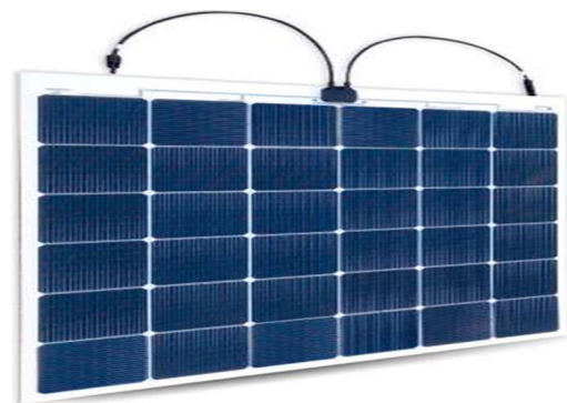
Fig. 3 PV panel

Solar energy is used to obtain clean and sustainable energy for the propulsion of the catamaran platform, operation of net