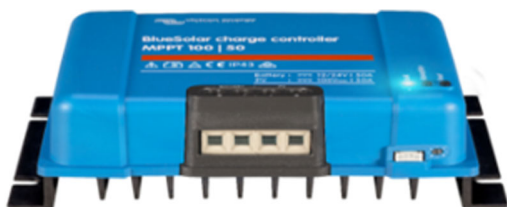
Fig. 4 Solar charge controller