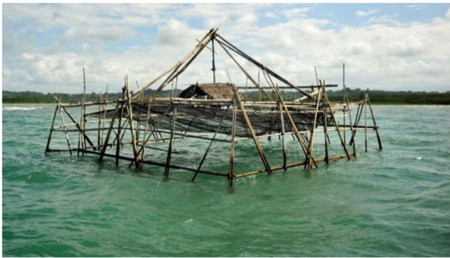
Fig. 1 Traditional bamboo fishing platform

on the platform. When the platforms are no longer useful due to age and decay, they are simply abandoned in their locations, eventually generating debris that is difficult to detect by passing ships. The fuel used for the electric generator sometimes drips into the sea and pollutes the surrounding area. Owing to these considerations, this study proposes an asymmetrical catamaran as an alternative to the bamboo structure; this catamaran is equipped with solar panels for a more environmentally friendly source of energy to be used on the fishing platform. Figure 1 shows a picture of the traditional bamboo fishing platform (Michelino 2010).