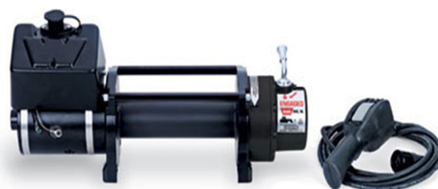
Fig. 5 Net winch

A net winch is used solely for lifting the net from under the sea when the net has been filled with a sufficient amount of fish. Two winches, as shown in Fig. 5, are employed for the lifting operation, one on each side of the inner hull of the catamaran. Ropes are tied to the upper edges of the net and rolled on the winch drum (Regnu Rama Das 2017). The winch itself is run through an electric motor powered by a set of batteries. The power required to run the net winch is from the maximum load of the winch multiplied by its work time.