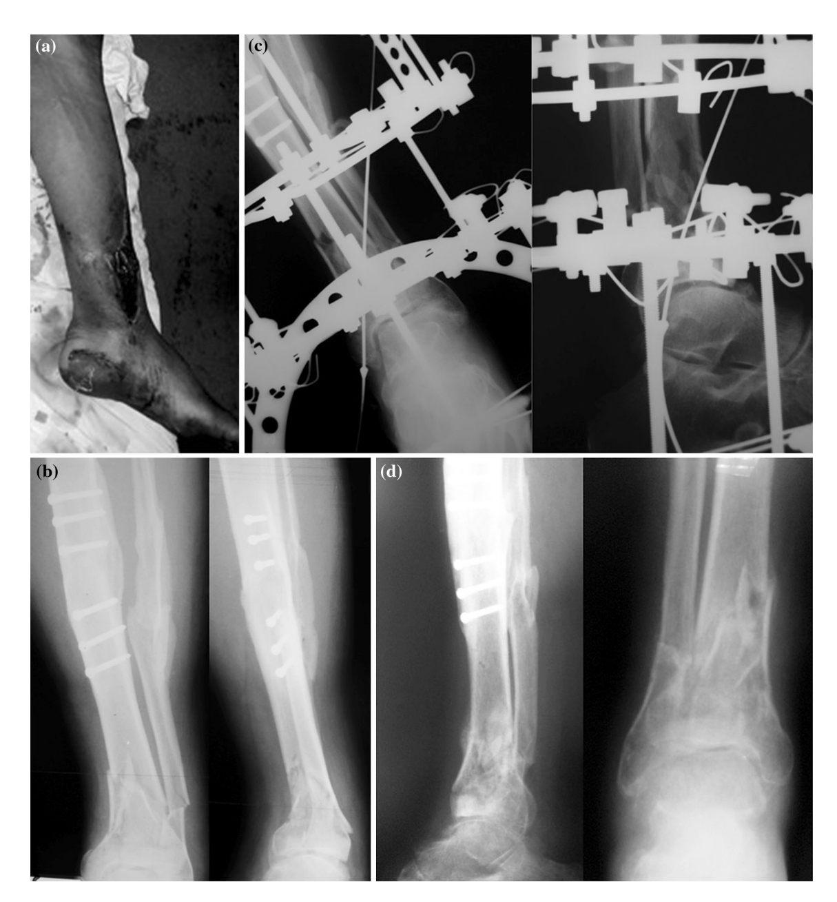
Fig. 2 An example of a 56-year-old male with a 3B open Pilon type III fracture- treated with Ilizarov fixator. a Clinical picture, b preoperative X-rays, c X-rays 6 weeks post-operatively, d nine months post-operatively the fracture healed, and the frame was removed

The surgical objectives for these injuries were debridement, soft tissue cover and stable fixation to allow weightbearing. Significant modifications of technique were