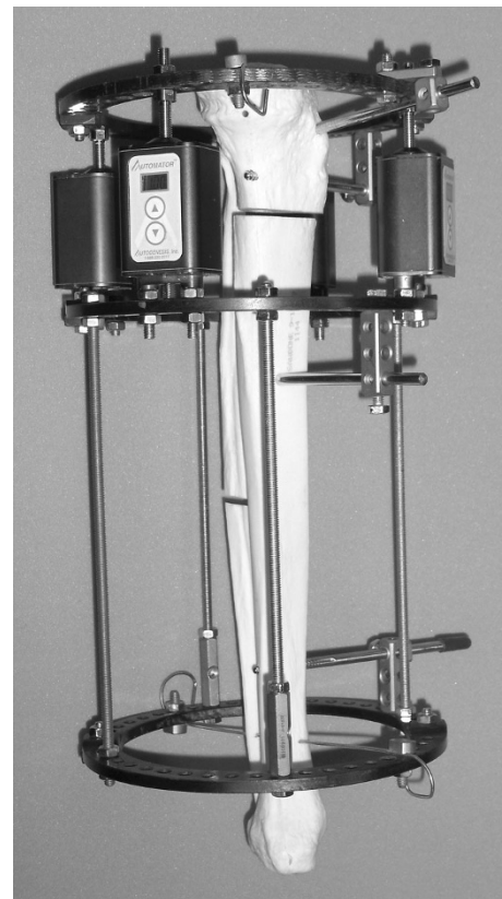
Fig. 2 The new motorized distraction device (Autogenesis, Inc., Baltimore, MD) on an Ilizarov ring fixator on a saw-bone model. In this even smaller device, the four motors already include the battery and control unit

This preliminary investigation into use of motorized distraction shows no significant difference in time to bone union. The potential benefits of improved compliance and