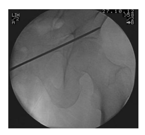
Fig. 3 Outlet view: intra-operative guiding K-wire