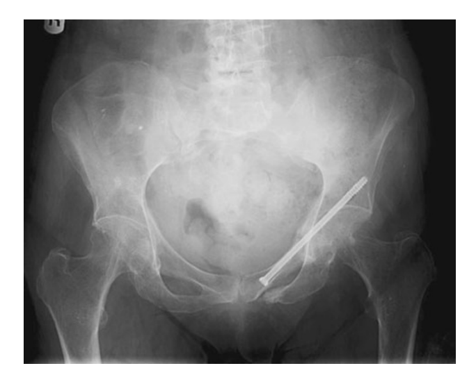
Fig. 6 Outlet view at follow-up

cannulated cancellous screw (Stryker, Waardenburg, The Netherlands) was then inserted. The patients received Fraxiparine<sup>®</sup> 0.3 ml (9,500 IE/ml, GlaxoSmithKline, Zeist, The Netherlands) during their hospital stay with