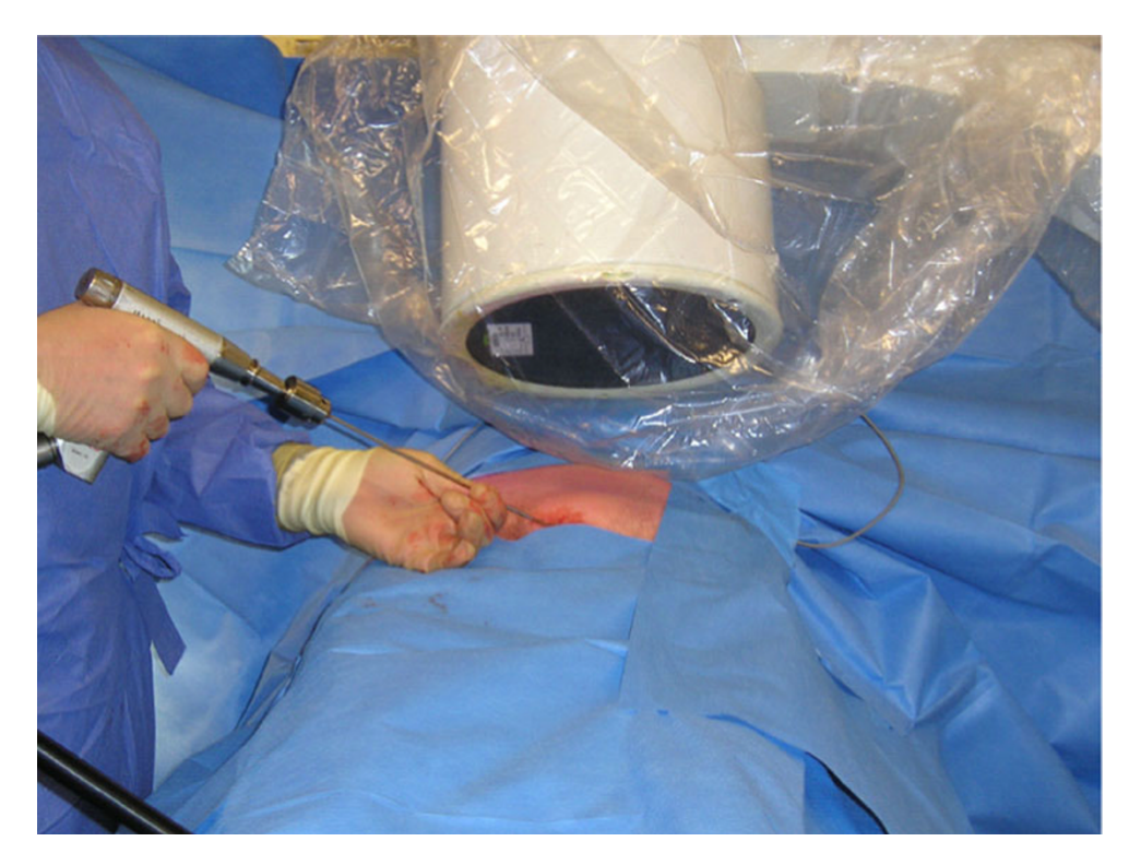
Fig. 1 K-wire is inserted in a retrograde direction within the distal medial fragment of the superior ramus pubis

The operative technique was described by Routt et al. [11] and a similar technique by Mosheiff et al. [10]. Biplanar fluoroscopy was used with inlet and obturator oblique views. The inlet view identifies the anterior pelvic ring anatomy. The obturator oblique view is obtained by combining the outlet tilt with 20 degrees of lateral C-arm rotation. This combination image demonstrates the safe zone for screw placement within the pubic ramus, including the area superior to the acetabulum. Intravenous cephalosporin prophylaxis (Kefzol<sup>®</sup> 2,000 mg, Lilly<sup>®</sup>, Houten, The Netherlands) was given once at the start of anaesthesia. A 2.4-mm K-wire was then inserted in a retrograde direction within the distal medial fragment of the superior ramus pubis under biplanar inlet and obturator oblique fluoroscopic control (Figs. 1, 2, 3 and 4) The K-wire is moved forward in a straight line cephalad to the hip joint. The appropriate length 6.5 mm partially threaded