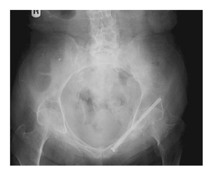
Fig. 5 Inlet view at follow-up

Eight retrograde superior pubic ramus screws were inserted percutaneously in six patients, with two patients having had bilateral fractures. The median time between injury and operation was 5 days (range 3–42). The median post-operative