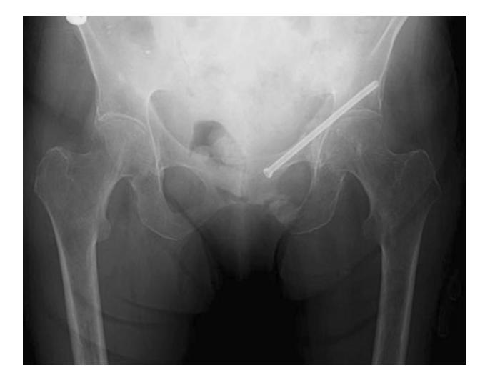
Fig. 7 Standard AP pelvis view at follow-up

hospital stay was 6 days (range 3–18). No screw violated the acetabulum. Post-operatively, one patient had pneumonia, two had confusional states, and one patient had a urinary tract infection. No wound infections or osteomyelitis occurred. After surgical intervention, three patients were pain free and three patients had substantial pain reduction. Four patients had regained their pre-trauma mobility, and two patients showed an improvement. Four patients were discharged to their original residence, and two patients were discharged to a rehabilitation unit. No screw breakage or loosening was observed. At 1-year follow-up, one patient had died, four were as mobile as before the fracture and without pain, and one patient was less mobile due to severe hip osteoarthritis.