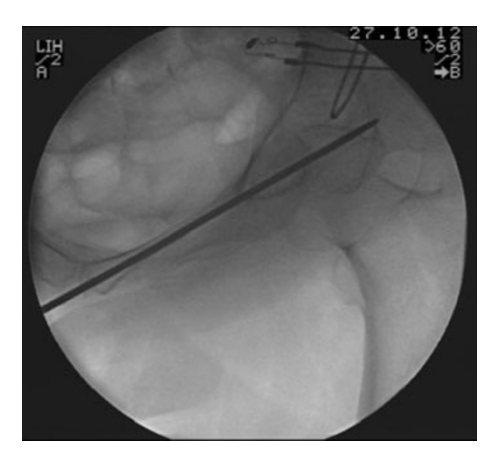
Fig. 2 Inlet view: intra-operative guiding K-wire