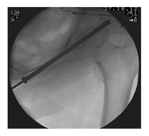
Fig. 4 Inlet view: intra-operative canulated screw placement

cannulated cancellous screw (Stryker, Waardenburg, The Netherlands) was then inserted. The patients received Fraxiparine<sup>®</sup> 0.3 ml (9,500 IE/ml, GlaxoSmithKline, Zeist, The Netherlands) during their hospital stay with