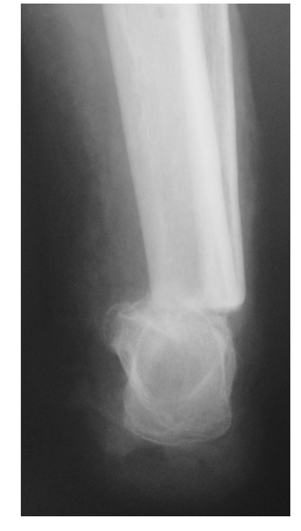
Fig. 3 Picture at 30 months postoperative follow-up showing the calcaneal flap fused to distal tibia

A below-knee prosthesis was adapted at 16 weeks postoperatively in all cases, and no need for stump revision occurred in this series during the entire follow-up period.