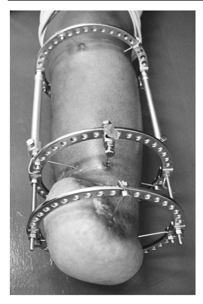
Fig. 2 Picture at 3 months postoperative follow-up showing the flap fixed and compressed by an Ilizarov external fixator