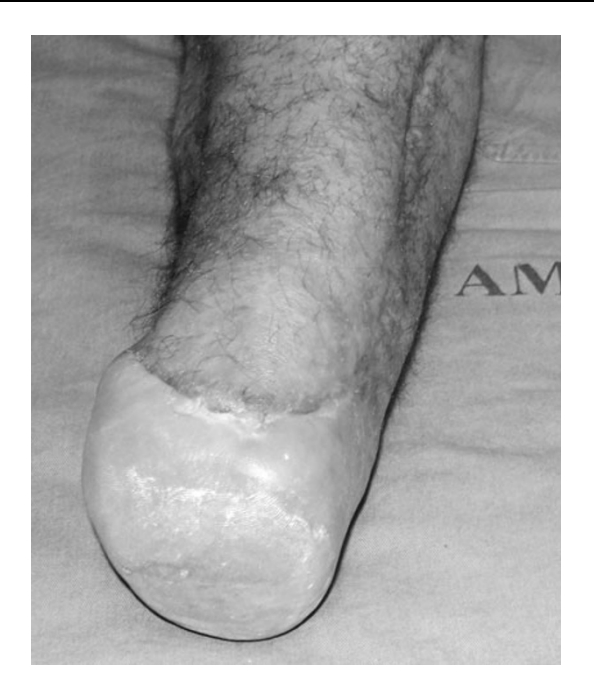
Fig. 4 Picture showing the clinical aspect of the stump at 30 months postoperative follow-up