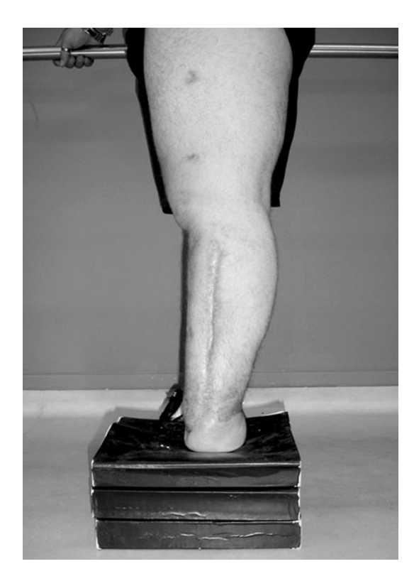
Fig. 5 Picture showing the patient able to support a painless full terminal weight bearing at 30 months postoperative follow-up

deformity with tíbio-talar chronic infection occurred. Because the angiographic examination revealed that the hind foot was perfused, the patient elected to undergo the procedure described above.