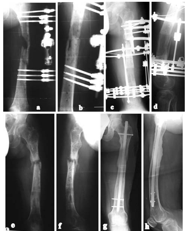
Fig. 4 C.A., man, aged 28. a, b Osteomyelitis after exposed fracture with bone gap, treated with external fixator and later osteosynthesis. c, d Check-up 7 months after transport. e, f Pseudoarthrosis at point of contact, 1 year after initial transport. g, h Check-up 3 years after nailing