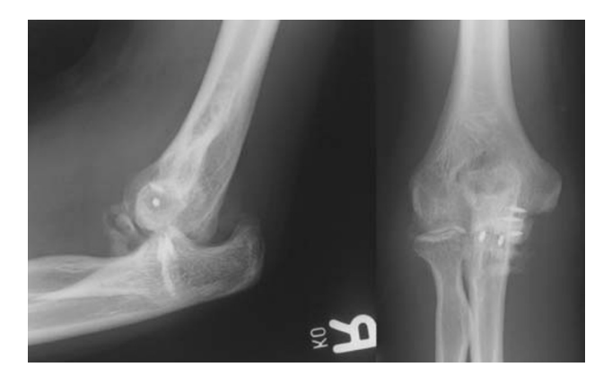
Fig. 1 Antero-posterior and lateral radiographs of patient 1 demonstrating chronic elbow dislocation 12 weeks after the index operation

Patient 2 is a 68-year-old man who fell on his outstretched right arm and sustained a complex posterior dislocation of the right elbow associated with a type III