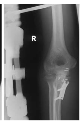
Fig. 3 Antero-posterior and lateral radiographs of patient 1 after distraction and reduction of the elbow using hinged external fixation and repair of the coronoid process, demonstrating a concentric joint-space

carried out twice a day. Using the compression/distraction unit of the fixator, the fixator was locked at night in maximum flexion and extension alternately. Pin site care was performed with a proprietary antiseptic (Octenisept<sup>®</sup>, Schülke and Mayr GmbH, Norderstedt, Germany) and dry wound dressing on a weekly basis; to avoid heterotopic ossification and to reduce pain, indomethacin was prescribed 50 mg bid with gastric protection for 6 weeks after surgery. The fixator was removed 8 weeks after the index procedure as an outpatient procedure.