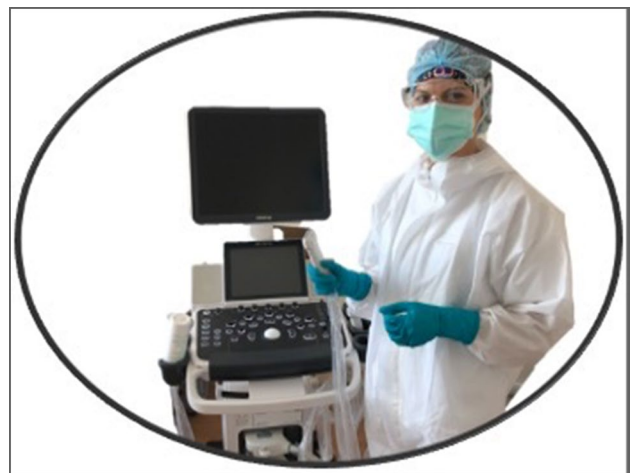
Fig. 2 Point of care US in COVID areas

Patients with finding of DVT underwent computed tomography pulmonary angiography (CTPA) examination performed using 64 MD GE Revolution Evo equipment, after administration of 60–80 ml of non-ionic, high-concentration contrast media (370mg/ml) followed by 40 ml saline chaser at 4–6 ml/s. Angiographic images were acquired in the