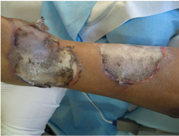
Fig. 1 Photograph of the lesion