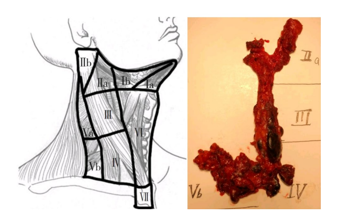
Fig. 2 Surgical landmarks of lateral neck node