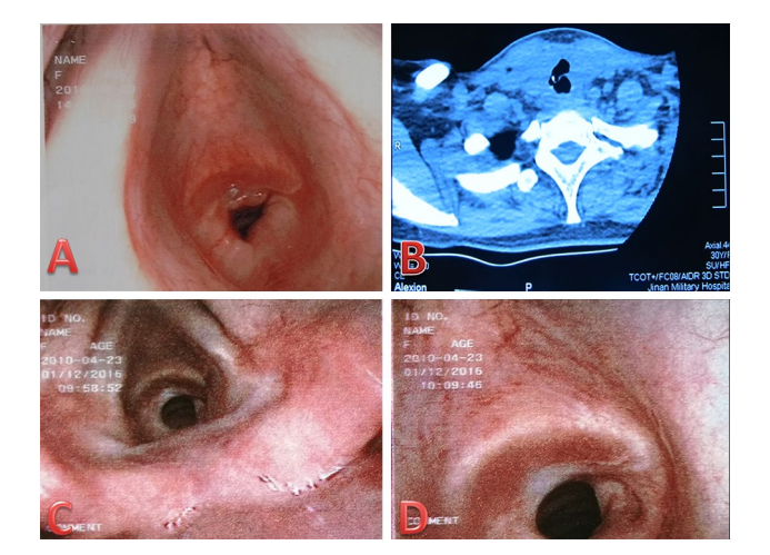
Fig. 5 Tracheal fistula and tracheal annular stenosis

2 months. Chyle leakages were managed conservatively with a fat-free diet and by placing a compressive dressing over the supraclavicular fossa without the need for further surgical intervention, symptom resolved within 2 weeks. There are three patients with RLN paralysis, and this was determined on laryngoscopy.