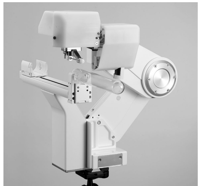
Fig. 1 iSR'obot MonaLisa (Biobot Surgical Ltd, Singapore)

Biobot (Biobot surgical, Singapore) is an ultrasound-based robot for transperineal prostate biopsy (Figs. 1, 2). It incorporates a pre-biopsy MRI with real-time transrectal ultrasound images to construct a 3D model of the prostate. All MRI targets and prostate boundaries and were defined with UroFusion (HT) (BioBot Surgical Ltd, Singapore). The iSR'obot™ Mona Lisa robotic transperineal biopsy device utilizes a software-controlled robotic arm which we mounted onto the operation table via a Micro-Touch™ stabilizer. The MonaLisa system was connected to a BK3000 ultrasound machine with a transrectal probe which mounted onto the robotic arm to provide a TRUS image of the prostate. Uploading of the previously generated UroFusion 3-D prostate model and suspected cancer lesions was then performed. UroBiopsy (BioBot Surgical Ltd, Singapore) is then used to generate the TRUS-based model which allows fusion of the mpMRI, and TRUS models. The robot has a gantry that utilizes a double dual-cone concept to ensure that the entire prostate can be sampled with two 1 mm perineal skin punctures and also defines the penetration depth automatically. All procedures were done under general anaesthetic, and at