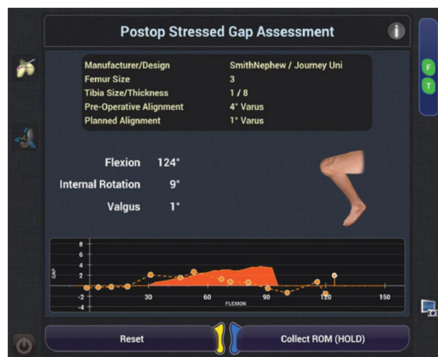
Fig. 5 Post-operative gap assessment under stress throughout a range of flexion

Overall survivorship of the knee implant in these robotic-assisted cases at 2 years (96 weeks) was 99.2% (95% confidence interval 94.6–99.9%), which was non-inferior when compared to the reference survival rate of 95.7% from the