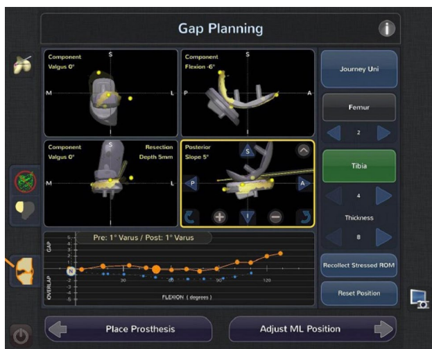
Fig. 3 Planning screen to show predicted gaps throughout a range of flexion

reaches the edge of the cut planes. For the UKA application, the NAVIO system is used to prepare all of the bony surfaces including the tibial and femoral planar surfaces and peg holes (Fig. 4).