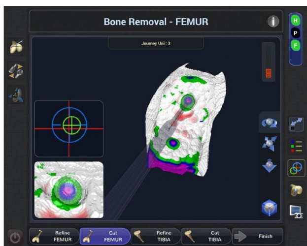
Fig. 4 Screen guidance during bone preparation showing the remaining bone to be removed

After the bone surfaces are prepared to the satisfaction of the surgeon, the wound is irrigated and dried. The surgeon then manually provisionally inserts the trial components ensuring appropriate alignment and balance through a full range of motion. The system displays the achieved coronal alignment and laxity of the knee and allows a comparison with the