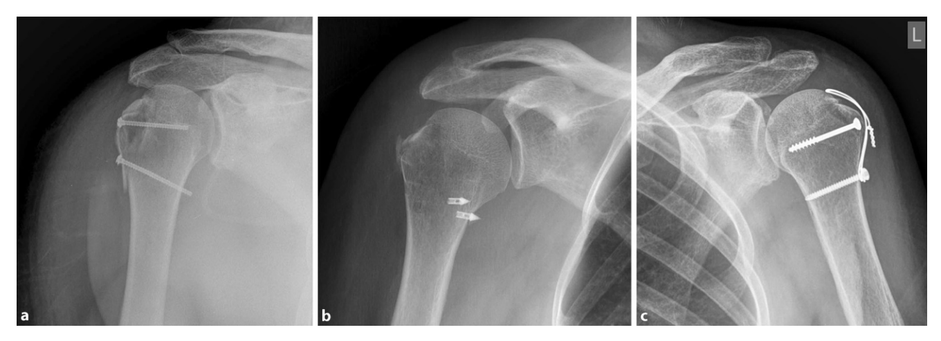
Fig. 1 Surgical fixation techniques: a percutaneous reduction and fixation using 3-mm cannulated self-tapping screws; b open reduction and fixation using sutures and suture anchors in a lateral single-row configuration; c screw fixation in combination with wire cerclages