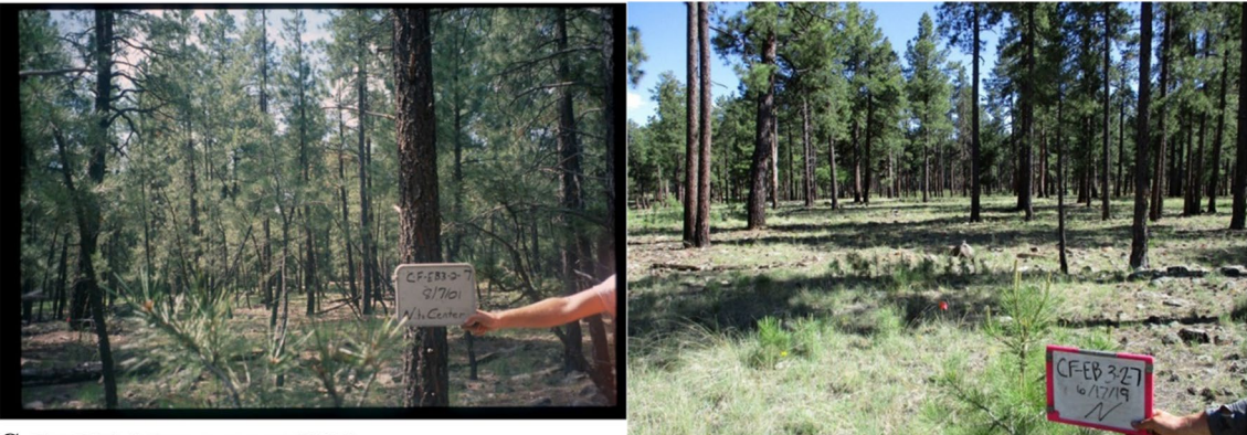
C Plot EB 3-2-7 pre-treatment (2001)