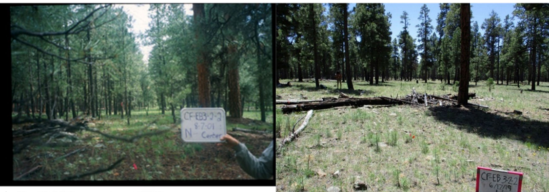
A Plot EB 3-2-2 pre-treatment (2001)