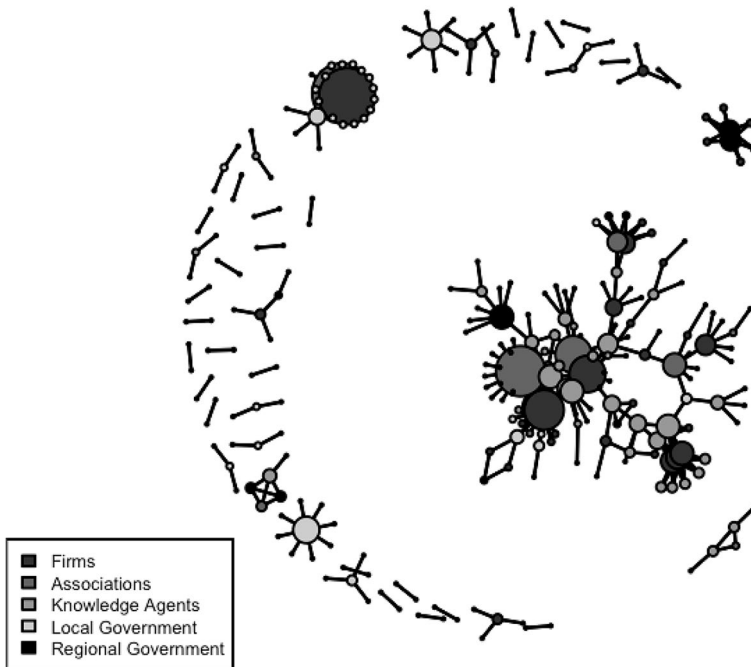
Fig. 3 The structure of the response network in the Valencia region

brokering strategies to study the implications for resource access and appropriation. Based on these authors, organizations show a high “coordinator” score when they act as intermediaries between members of their segment. “Representatives” allow members of their group to contact members of another group. A high “Inter-connector” score is achieved when relationships are facilitated between different segments and they are not members of any of these groups. Finally, the global brokerage score merges the three aforementioned possibilities.