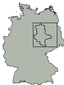
Fig. 2 Dike relocations in Saxony-Anhalt, Germany. *Note: The figure shows 23 measures; however, for one of the measures in the “long-term realization” phase, it is currently still unclear whether it will be implemented as a dike relocation or as a polder. For that reason, we speak of only 22 dike relocations in the text