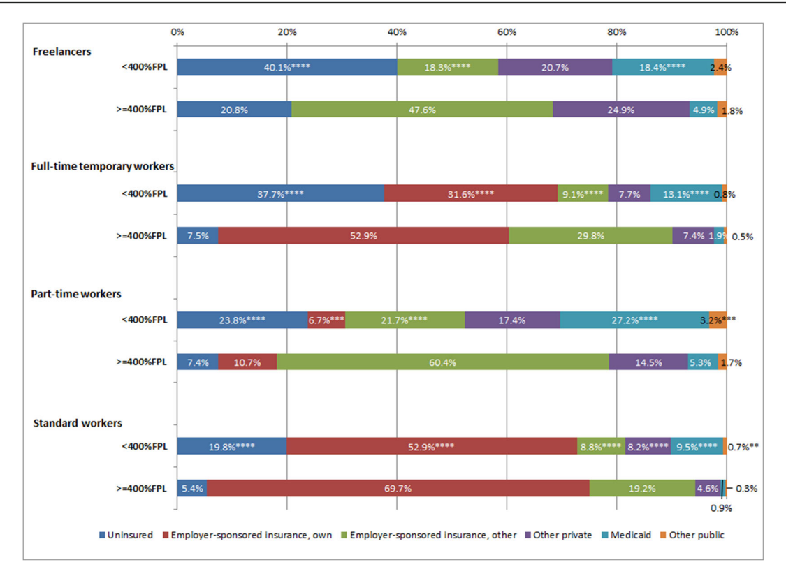
Figure 3 Insurance status among non-elderly workers by work arrangement category and household income in 2015–2017. Note. FPL, federal poverty level. ****, ***, ***, and * indicate statistically significant difference at the p <.001, p <.01, p <.05, and p <.10 level between the two income categories.