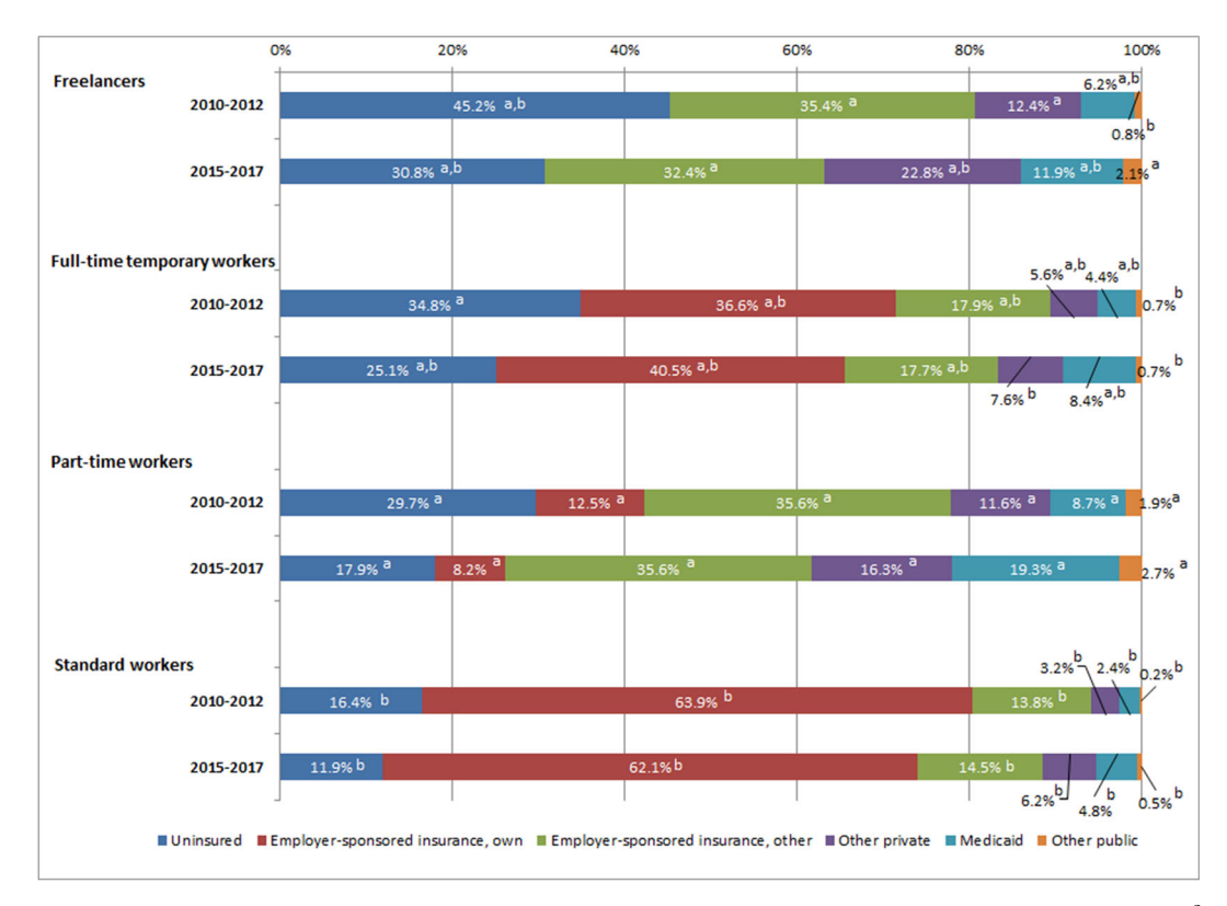
Figure 1 Insurance status among non-elderly workers by work arrangement category in 2010–2012 and 2015–2017. Note. <sup>a</sup>Statistically significant difference at the p<.05 level compared to standard workers. <sup>b</sup>Statistical difference at the p<.05 level compared to part-time workers.

Despite large decreases, uninsurance rates remained higher for all three types of non-standard workers than for standard workers (11.9%) in 2015–2017 (Fig. 1). The uninsurance rate was higher for freelancers (30.8%) and full-time temporary