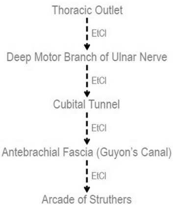
Fig. 6 Application of the hierarchical SCT to brachial plexus injury (corresponds to Video, Supplementary Digital Content 2, https://vimeo. com/59943111). This patient had a right medial cord injury and on physical examination had significantly more wasting of the ulnar-innervated intrinsic muscles as compared to the median-innervated intrinsics. A multilevel injury was suspected, and a hierarchical SCT was performed to determine secondary entrapment points on the ulnar nerve. The sequence of collapse in this patient was the right thoracic outlet (consistent with the medial cord injury), followed by the deep motor branch of the ulnar nerve, cubital tunnel, volar antebrachial fascia, and the arcade of Struthers