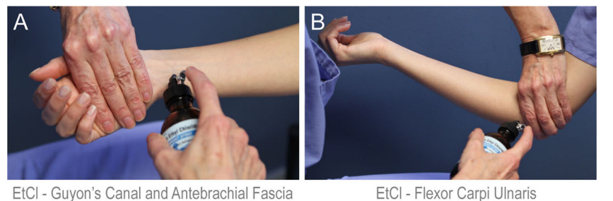
EtCl - Guyon's Canal and Antebrachial Fascia

Fig. 4 Demonstration of the use of ethyl chloride (EtCl), a topical anesthetic, to "freeze out" a site of ulnar nerve compression that has yielded a positive SCT. In order to very specifically anesthetize the desired anatomic site, it is important to shield the areas where you do not want the ethyl chloride to reach. a Application of ethyl chloride to the