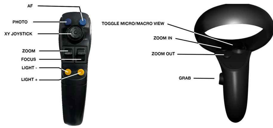
Fig. 4 Illustration of the Oculus Quest 2 hand controllers with labels indicating their function within the SurgiSim environment