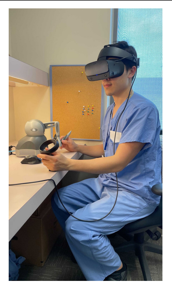
Fig. 1 A surgeon wearing an Oculus Rift S with his left hand holding a controller and his right hand holding a haptic hand controller

With SurgiSim, a user creates realistic surgical scenes derived from clinical volumetric computed tomography (CT) imaging data from DICOM files. Segmented anatomic structures are incorporated into this texture-based volume rendering. Volumetric structures may be represented with predefined or customized material properties and viewed with a variety of stereoscopic displays using real-time volumetric rendering. The image datasets underwent auto-segmentation using a machine learning model that was