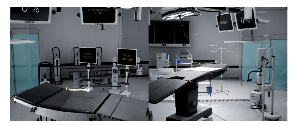
Fig. 1 Screenshots of the virtual scenario

point of the simulator. He/she needs to examine and fix the case by selecting/moving the fragments.