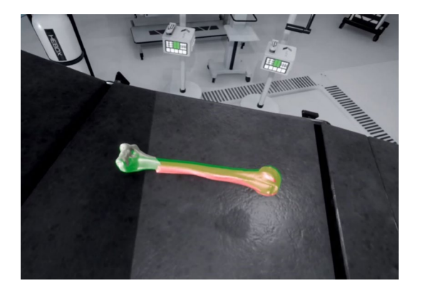
Fig. 4 Example of a template of the bone where the user tries to fit the fragments. It corresponds with the contralateral part

We selected seven users to perform a surgical reduction using the proposed system. They are experienced in