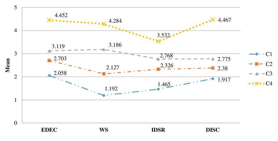
C1 = Low addiction risk; C2 = Medium addiction risk; C3 = High addiction risk; C4 = Critical addiction risk

The results from the LPAs provided four classes of Internet users on the basis of the scores obtained in all four dimensions of the IDS-15. Just below one third of the total sample was classed as having a "low addiction risk" (30.11%) because they exhibited low scores in all dimensions and, therefore, few problems related to Internet usage. Over one third of the Internet users were categorized as "medium addiction risk" (43.74%) because they had problems in the subdomains EDEC, IDSR, and DISC. Here, respondents used the Internet more frequently to escape and dysfunctionally cope with their emotions while also exhibiting difficulties in self-regulation and self-control. When comparing the first class with the second, the scores in all four dimensions indicated similar trends. It is noteworthy that the EDEC dimension yielded the highest scores in both classes. One fifth of the participants belonging to the "high addiction risk" class (20%) were characterized by a higher tendency to escape and