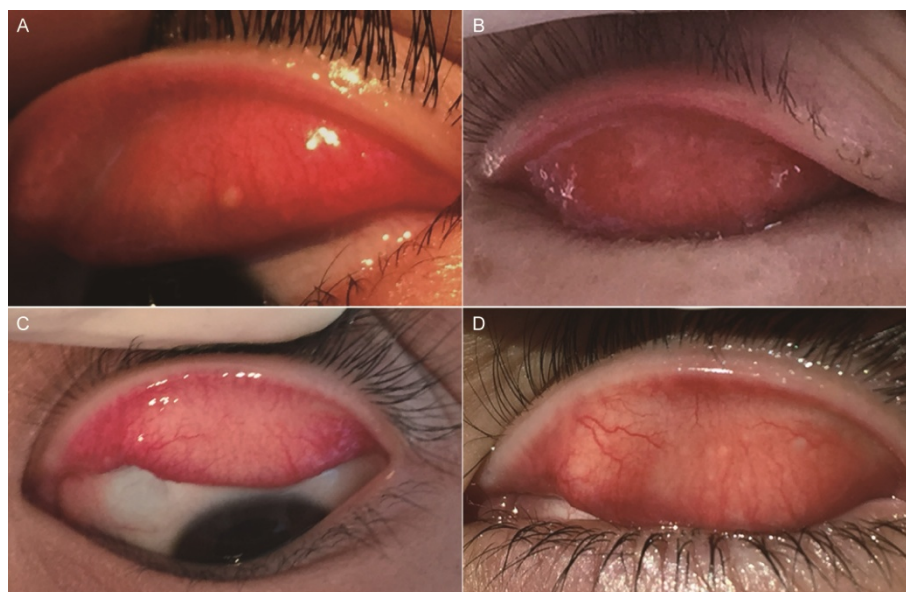
Figure 1 Images of infectious conjunctivitis. A, Bacterial conjunctivitis. B, Adenoviral conjunctivitis. C, TF. D, TF and TI.

Conjunctivitis is the most common ocular surface disease, especially in children (Dominique et al., 2010). There are more than 6 million patients diagnosed with acute conjunctivitis in the United States each year, with the cost of treating bacterial conjunctivitis alone estimated at $380–860 million per year (Smith and Waycaster, 2009; Udeh et al.,