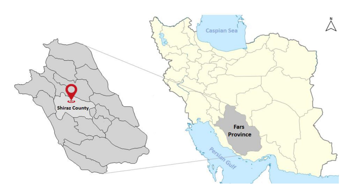
Fig. 1 Map of the study area. Right: Map of Iran, Left: Location of Shiraz County in Fars province

This retrospective study was conducted from March 2019 to March 2021 among patients referred to hospitals affiliated to Shiraz University of Medical Sciences for stool examination. In this cross-sectional study, a retrospective review based on data of the past 2 years in the pre- and post-COVID-19 pandemic was used. The study participants were inpatients and outpatients referred to Namazi and Shahid Faghihi hospitals (Sa'adi hospital), two main teaching hospitals affiliated