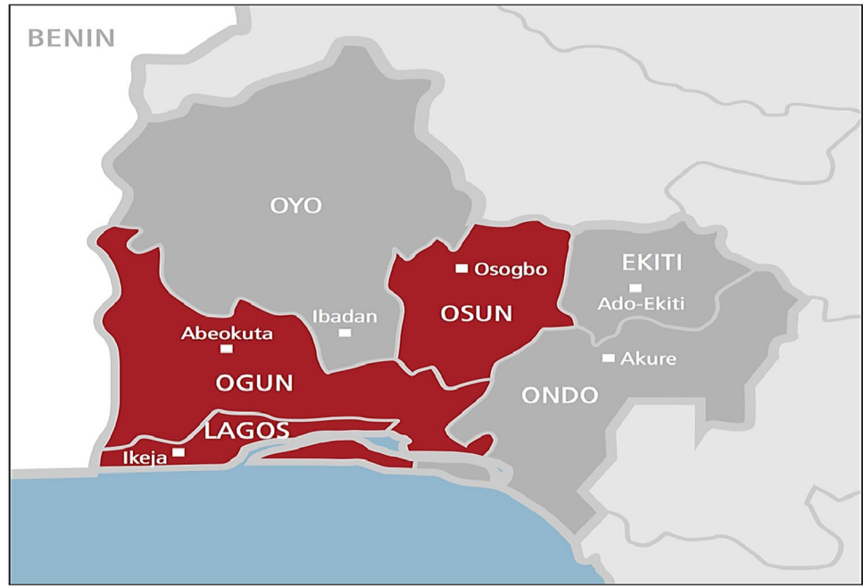
Fig. 1 Map of South-West Nigeria showing the study areas; Ogun and Oyo states.