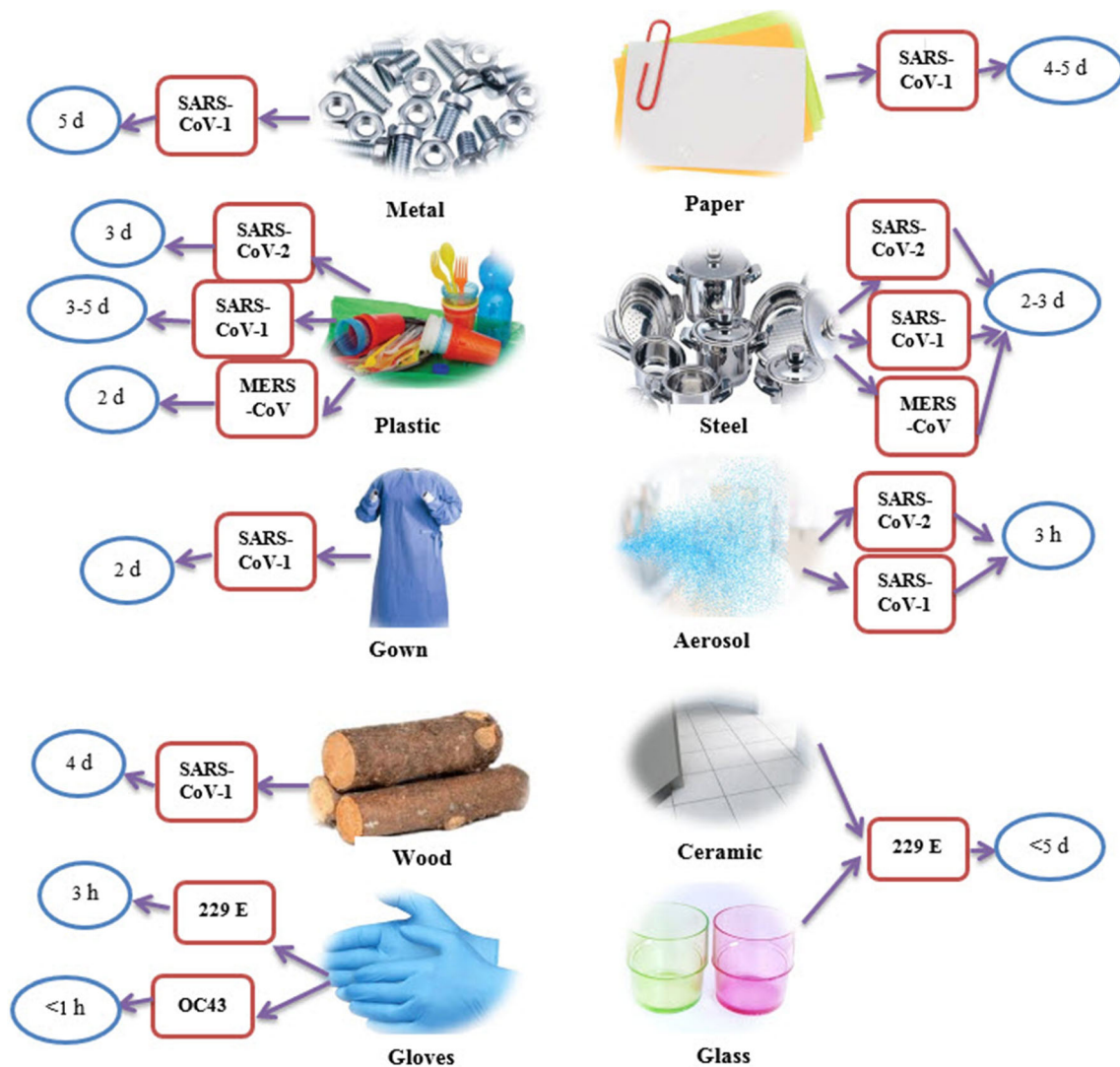
Fig. 2 Persistence of human CoVs on various surfaces according to results of included studies