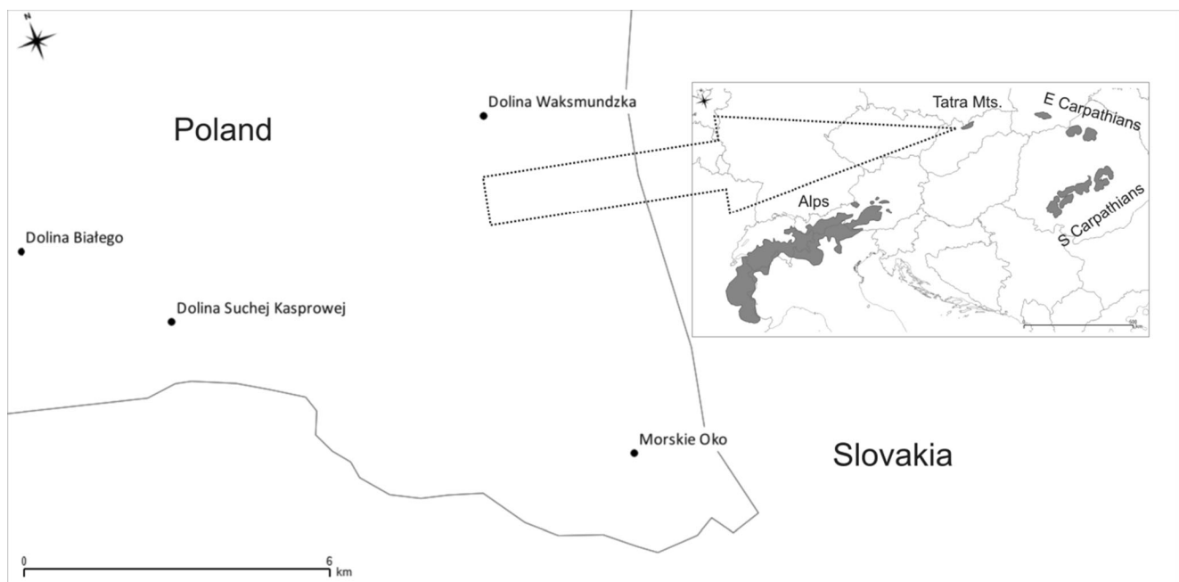
Fig. 1 Location of populations of Pinus cembra in Tatra Mts. and the species natural range in Europe (gray-shaded areas). Distribution map courtesy to EUFORGEN, http://www.euforgen.org/distribution_maps.html

available a priori. To cope with this, we developed a mixed mating model-based regression analysis, in which unknown outcrossing rates were expressed as a function of the explanatory variables.