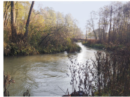
Fig. 2 Biała Przemsza river after Biała river tributary

Bottom sediment of the Przemsza river and its tributaries is severely contaminated with heavy metals exceeding hundreds of times the background values established by Turekian & Wedepohl 1961 (Table 4). Maximum metal concentrations in the fraction <63 \mu\text{m} sampled in 2014 and in 1995 were as follows respectively (in mg/kg): Zn 28,158 and 29,580, Pb 9451 and 19,510, and Cd 154 and 269. The arithmetic mean for concentration of Zn, Pb and Cd in the fraction <63 \mu\text{m} of all investigated rivers has remained comparable in both collection periods and equals respectively to the following (in mg/kg): Zn 16,918 and 13,505, Pb 4177 and 4758, and Cd 92 and 134. Very high load of metals is introduced to the Przemsza river by its tributaries. In 2014, the concentrations of heavy metals in the bottom sediment of the most polluted rivers Biała Przemsza (Fig. 2) and Sztola were as high as follows (in mg/