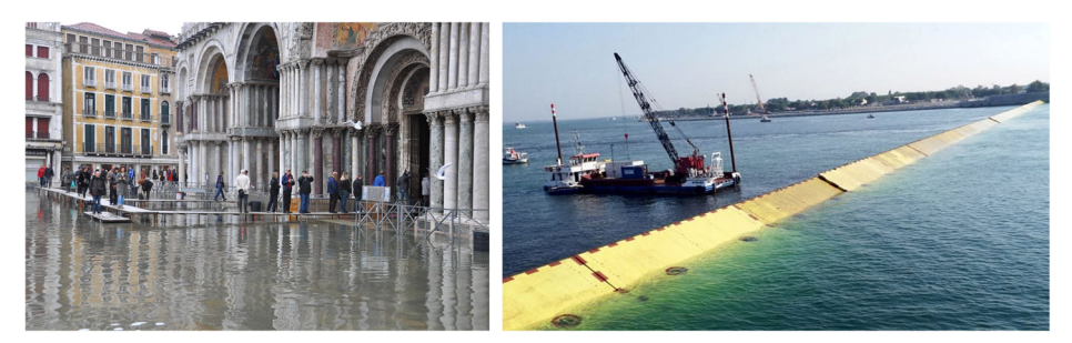
Fig. 2 The Acqua alta in Piazza San Marco (left) and the MOSE flood barrier in Venice, Italy (right)

In summary, to defend Venice from Aqua altas, both structural and non-structural measures have been implemented: from the structural perspective, the MOSE project has encountered many difficulties thus far in terms of reaching the proposed objectives; a local defence consisting of urban centres that protects the city from the standard conditions of an Acqua alta has been constructed, while avoiding the filtration of water from the subsoil.