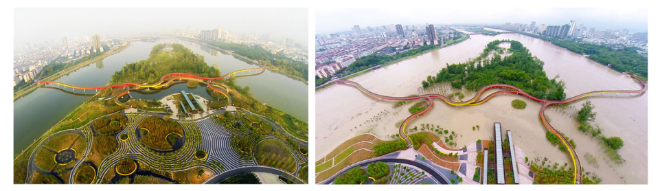
Fig. 3 An aerial view of the park during the dry season (left) and the monsoon season showing a 20-year flood (right) (Turenscape 2019)

sector. For these reasons, efficient simulations that aim to predict and visualize infrastructures must be carried out.