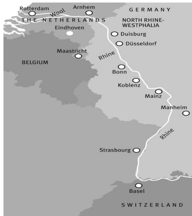
Fig. 4 Map Rhine river basin

The Working Group has mainly worked on joint research projects, e.g. on extreme levels of high water in the upper Rhine area (Lammersen 2004), and cross border risk