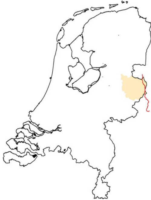
Fig. 2 Map river Dinkel