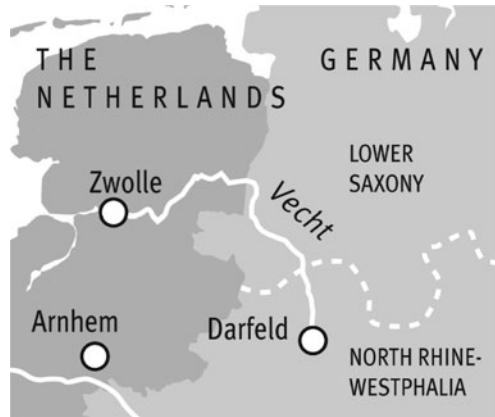
Fig. 3 Map river Vecht

Subsequently the WFD asked for a monitoring system that included chemical and biotic indicators. A working group of Dutch and German water managers addressed this issue for the relevant area. A Dutch and two dissimilar German federal guidelines for monitoring already pre-existed and had to be harmonised somehow. The working group discussed the differences and possibilities for cross-border calibration. To create completely identical systems proved impracticable due to the impact of German federal requirements. But calibrating the systems was possible and now German and Dutch data can be converted. This enables upstream water managers interpret downstream data in their own system and reversed.