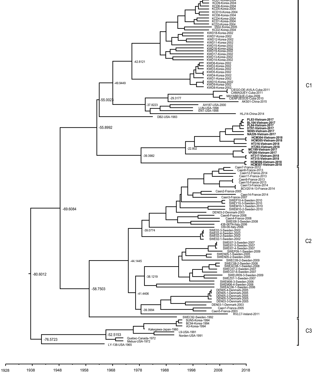
Fig. 1 Bayesian phylogenetic tree (under a strict molecular clock) for the full-length S gene of BCoV. The maximum clade credibility (MCC) tree was built using the best model (GTR+I+G) and is

scaled to time (horizontal axis). The times at which C1, C2, and C3 diverged from a common ancestor are denoted at the nodes \frac{1}{2}