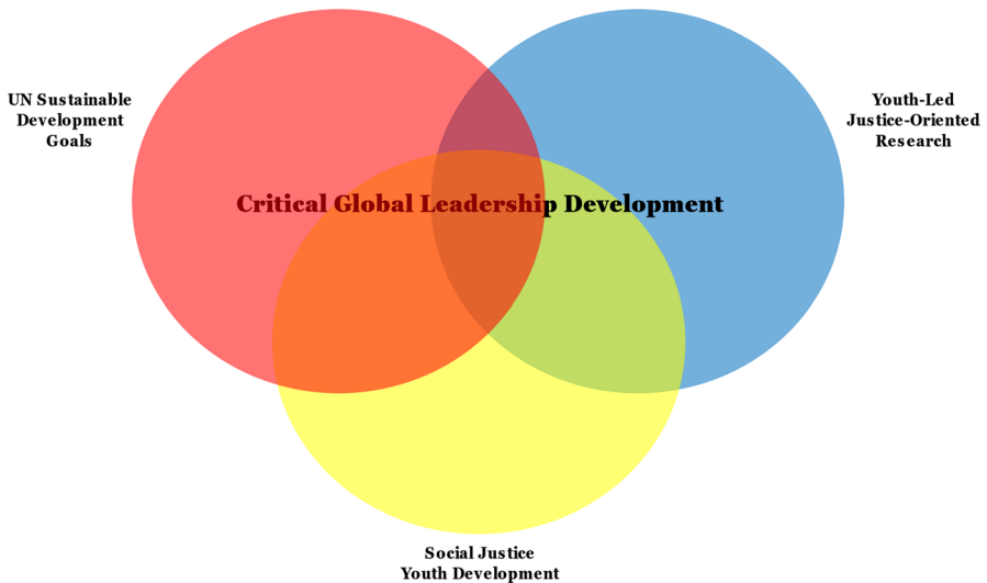
Fig. 2 A framework for critical global leadership development

sense of agency through giving them common language to more deeply understand the underlying issues and to provide their own solutions to tackle them. Overall, we found that the integration of the SJYD focused curriculum, employing youth-led critical research, and the UN SDGs together formed a strong foundation for the development of the youth’s critical global leadership (See Fig. 2).