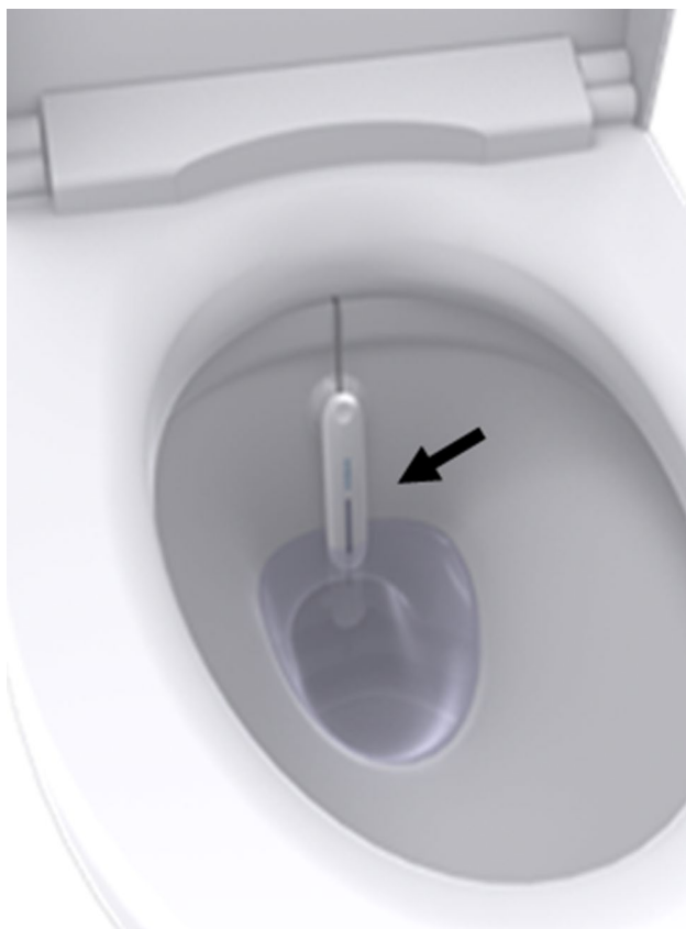
Fig. 2 The s-HMSU system includes a server, measurement device, and a user terminal. The sensor is located in the water in the toilet bowl (black arrow). s-HMSU, self-health monitoring system for urine excretion

To measure 24-h voided volume, we used the s-HMSU system (Symax Inc., Tokyo, Japan). The s-HMSU system includes a server, a measurement sensor (Fig. 2), and a user terminal. The sensor is installed on the toilet itself and calculates the volume of urine excreted using a fluid model, including the shape of the toilet bowl and the known volume and temperature of the water in the bowl. We have previously validated the measured voided volume of the s-HMSU