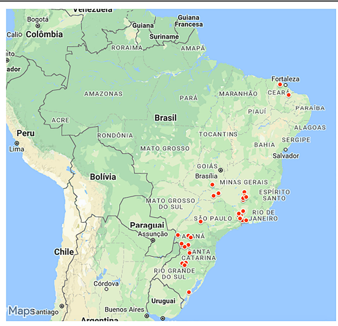
Fig. 1 Spatial distribution of the 39 farms belonging to 29 municipalities located in eight states of Brazil analyzed in this study

guanidinium isothiocyanate nucleic acid extraction methods (Alfieri et al. 2006). Samples were screened for RVA by silver staining after polyacrylamide gel electrophoresis (PAGE) (Herring et al. 1982) modified by Pereira et al. (1983).