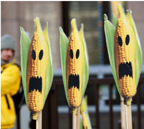
Fig. 2 Depiction of GE maize by Greenpeace

nity-based conservation efforts that should be supported.”