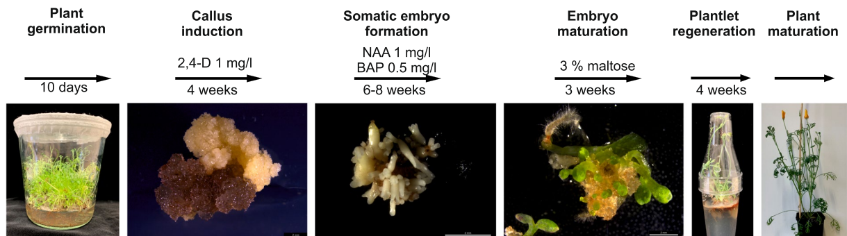
Fig. 2 Time scale of plant regeneration from E. californica hypocotyl explants. Hypocotyl of 10 days old E. californica plants was used to induce callus growth on callus medium. After 6–8 weeks in the dark at 25 °C, regenerated callus cells were transferred to somatic embryo induction medium. For embryo maturation, regenerated embryos

were transferred for three weeks to maturation medium. After maturation, all embryos were incubated in long day conditions (16 h light 8 h dark) on plant regeneration medium without hormones. Regenerated plants were transferred to soil, covered with a cap for two weeks, to maintain humidity