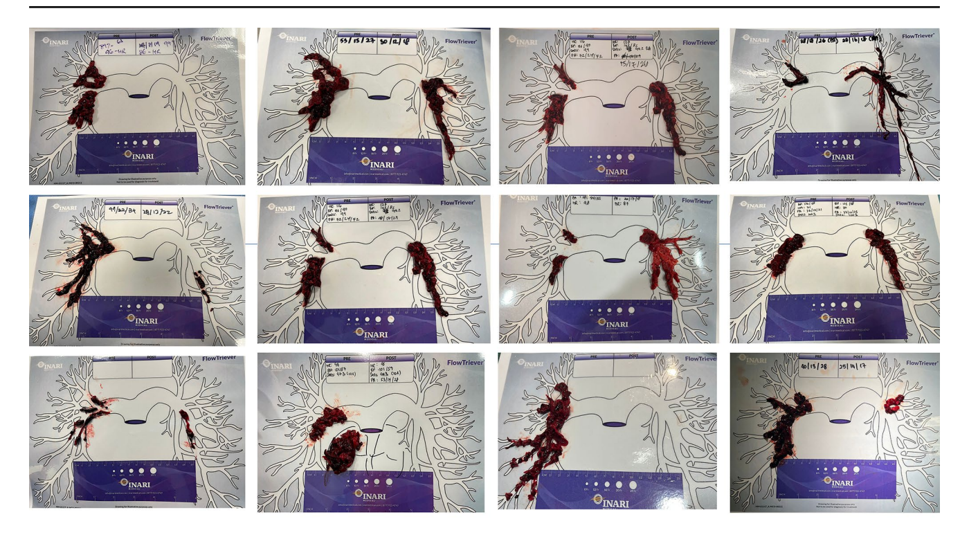
Fig. 1 Images of thrombi aspirated for patients, placed on an anatomical representation of the pulmonary arteries