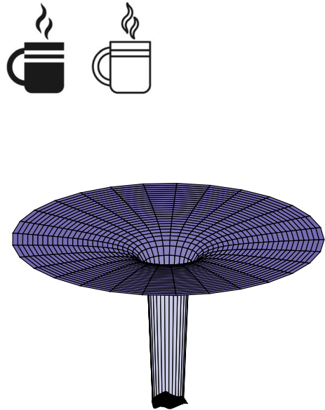
Fig. 1 Illustration of Wheeler’s original TE. In this experiment, it is imagined that two cups of tea are dropped into a black hole

may have decreased in the process. It is in this sense that the second law appears to be transcended. (Bekenstein 1972, p. 737)