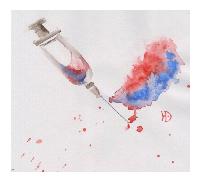
Fig. 2 Inj(f)ection , painted by Yulia Erokhina

When researching the process of stereotyping the Russian Orthodox Church in fake news in the context of the COVID-19 pandemic, it makes sense to consider measures to reduce social entropy and increase negentropy, and their significance. The following pattern has been revealed: when we try to fight unreliable information, we only root it deeper in mass consciousness [37, 68]. That is, a powerful counteraction