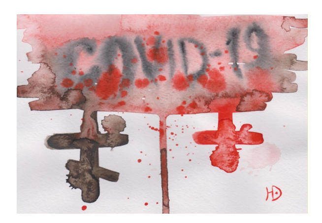
Fig. 3 Those in Need of a Mira cle , painted by Yulia Erokhina

Any significant public address of the Russian Orthodox Church in this respect is inevitably accompanied by scandalizing. Allegedly, in Russia, the Russian Orthodox Church is a social institution that has suffered the most from the current pandemic. The majority of the residents of the largest Orthodox monasteries – be it the pilgrims