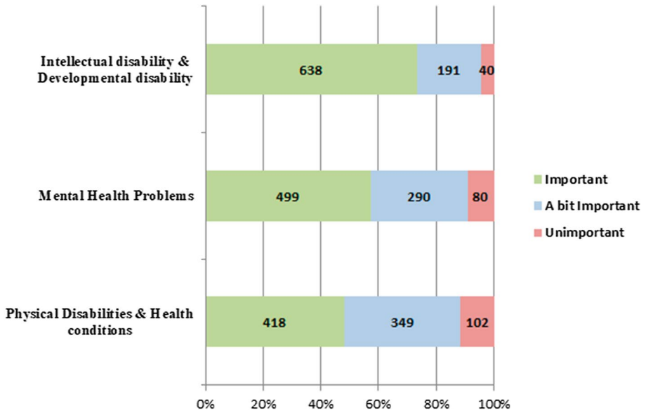
Fig. 3 Importance of disability to dating decisions: respondents living in Hong Kong