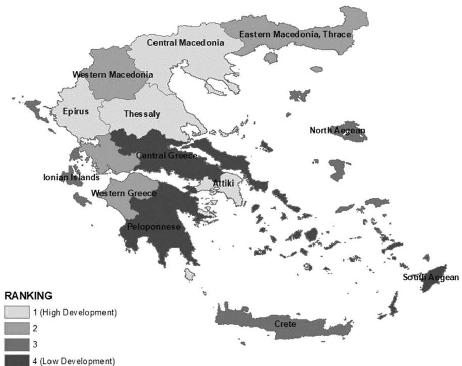
Fig. 1 Regional rankings of CI in quantiles in Greece, NUTS 2, 2011.