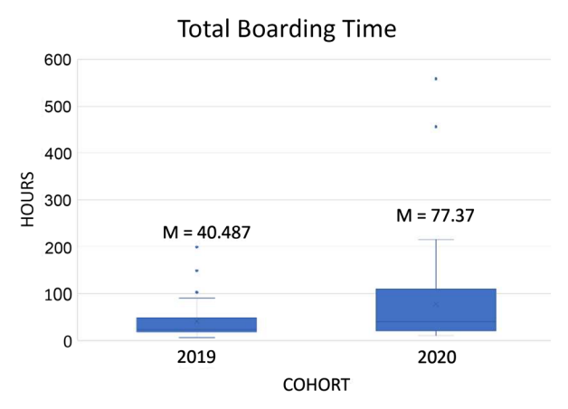
Fig. 3 This is a box and whiskers plot where the X axis is the cohort and the Y axis is the total boarding time in hours. There is one box for each cohort, for a total of two boxes within the plot. The 2019 cohort has a thinner box, with text that says M = 40.487 above the plot. The lower whisker lies above 0 on the Y axis while the top whisker lies below 100 on the Y axis. There are three dots above the top whisker, the topmost of which reach 199.5 on the Y axis. The 2020 cohort has a thicker, taller bar with text that says M = 77.37. The lower whisker lies above 0 on the Y axis, while the top whisker reaches over 200 on the Y axis. There are two dots above the top whisker, the top-most of which reaches 558.5 on the Y axis