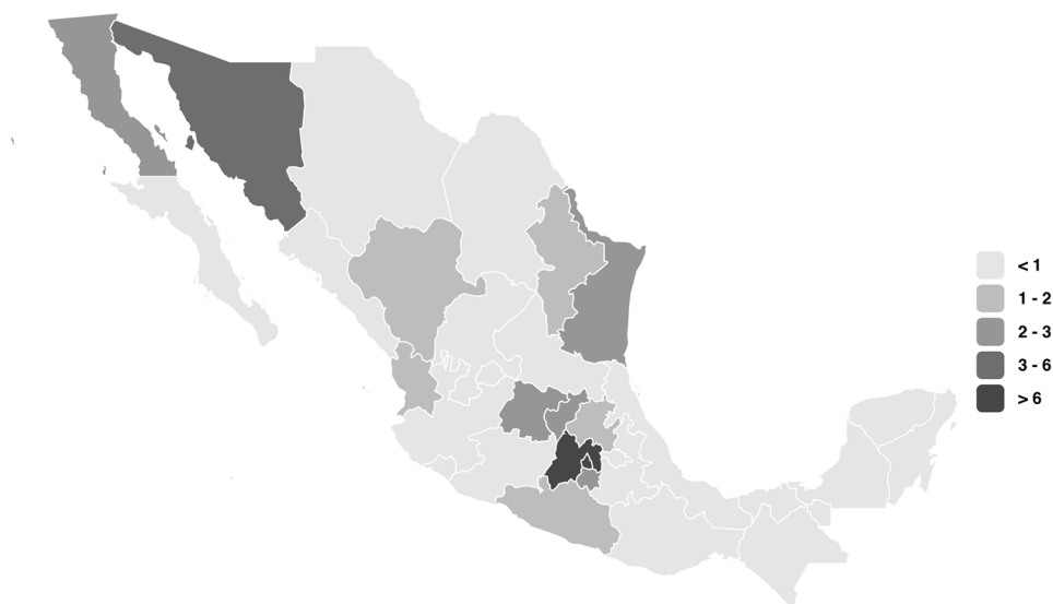
Fig. 2 Map from the origin of the included interventions

or dietary component. Some studies (17; 58.6%) included a PA component, and less (13; 44.8%) included behavioural or physiological components. Few studies (6; 20.7%) considered environmental or setting changes (e.g., modifications to the school food stores or improving the school's infrastructure) (Table 1). Only Costa-Urrutia et al. (2019), Safdie et al. (2013a, b) and Levy et al. (2012a, b) included all the components considered in this review (i.e. considered in the studies a nutritional, PA, behavioural and an environmental change). The studies' duration varied, ranging from 2 days to 3 school years. The frequency and intensity of the interventions (calculated from the reported data) also varied from 2 to 200 sessions with different intensities (Table 1). Further details on the components and characteristics of each study are provided in Supplementary Information 1.