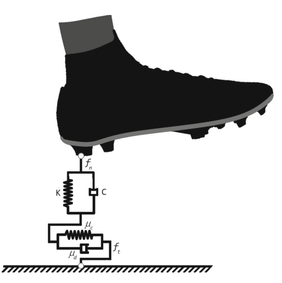
Fig. 2 Spring-damper model that characterizes the contact process between a foot and the ground. Two sets are displayed, one for each contact direction (normal and tangential)

In contrast to nonsmooth methods, approaches based on contact forces are proposed. They are also known as penalty [87], compliant [88] or regularized [89] models. Regularized makes reference to the process of reformulating a problem, trying to get a solvable representation of it [90]. Applied to the study of contact forces, it can be said that a model of this kind can approximate the contact phenomenon in such a way it can be properly modelled. Penalty methods are characterized by their simplicity, computational efficiency and implementation easiness [31, 91], allowing them to deal with specific events such as repeated impacts properly [8, 92]. These approaches are widely used in nowadays commercial FEM and MBD software [93–96]. Penalty models define contact forces as continuous functions of the relative penetration (and its temporal derivative) of the contacting bodies [87, 97], which are supposed to be deformable (hence, the adjective compliant, as the surfaces of both bodies couple) [98]. The contact regions of each body are modelled as a set of spring-damper elements scattered over their surfaces (see Fig. 2). Most of the models based on this approach consist of two terms: one