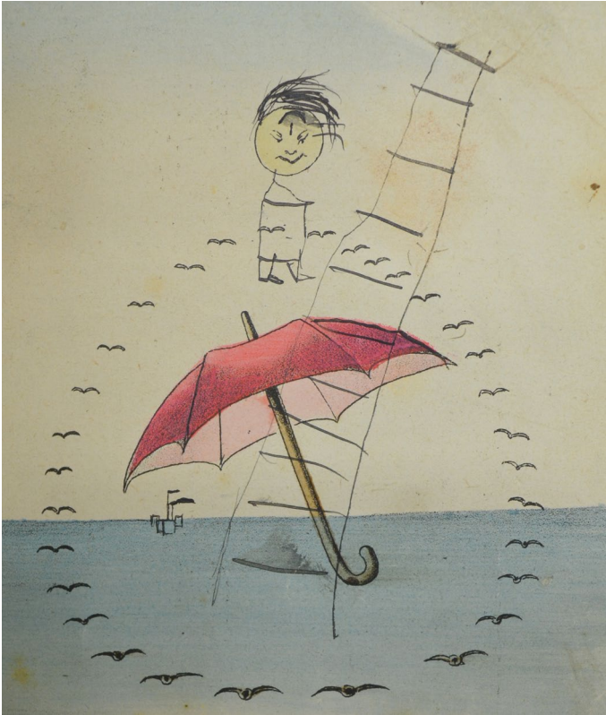
Fig. 1 Anthropomorphization of animals or inanimate objects ([Anonym 1890], unpag.; Göttingen Collection S 2b 73)

book Mecki und die 40 Räuber (Rhein and Petersen 1960). Its former owner marked the colorfully illustrated volume with spacious circle movements (cf. Fig. 3). Not always but in most cases, both forms of painting in seem to try to fill a vacant or less intensively colored space. We suggest that these actions might be based on the embodied experience that things have colors. The fact that things, i.e. objects in the world, do not only have shape and extension is a generalization which can only be made on the basis of perception experiences (cf. Johnson 1999, pp. 86–88; Shapiro 2011, pp. 81–85), a generalization that white spaces and especially black-and-white-drawings do not comply with. Since small children are not yet able to completely recognize the fictional character of paintings (cf. Corriveau et al. 2009; Weisberg and Sobel 2012; Rakoczy 2008), a desire could be to give these spaces, or things, colors. In addition, there might always be individual aesthetic preferences.