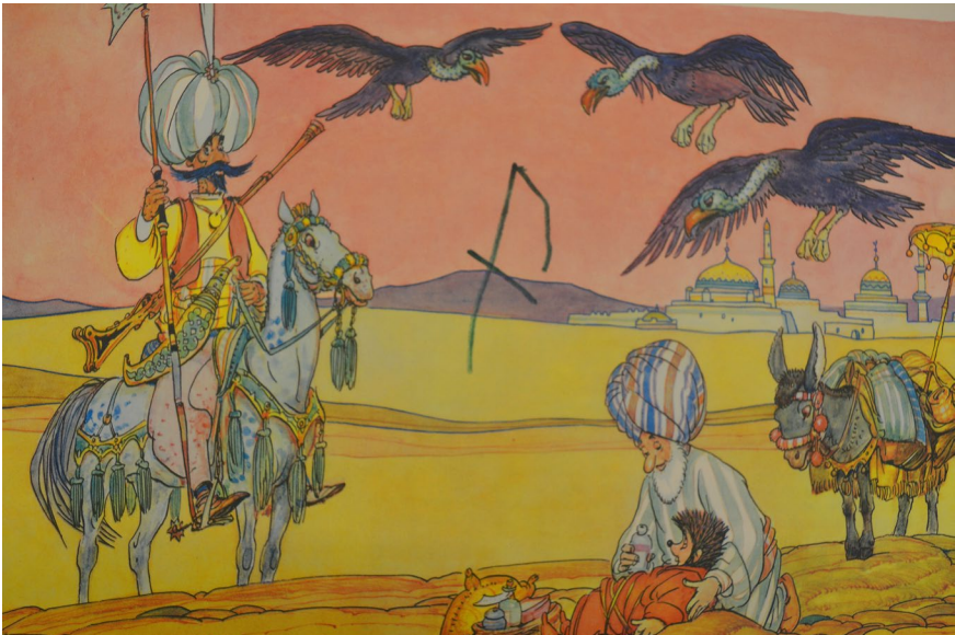
Fig. 4 Cross mark (Rhein and Petersen 1962, unpag.; Göttingen Collection S 22a 21)