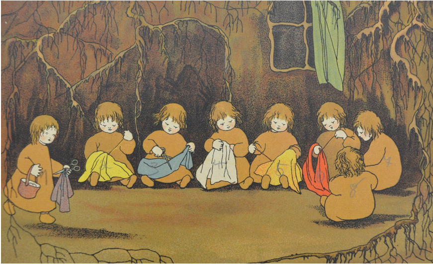
Fig. 5 Numbering (Olfers 1965, unpag.; Göttingen Collection Stacks)

or events, which means they do not only become part of the diegesis by immersion but also evaluate specific aspects of it. In the case of the Göttingen copy of Mecki und Sindbad (Rhein and Petersen 1962), personal references to individual characters or possibly even situations were made by marking them with a cross (cf. Fig. 4). Further research has to clarify whether such marks can also express more complex issues than positive or negative references alone. A copy of Sybille von Olfers' Etwas von den Wurzelkindern (Olfers [c. 1965]) exemplifies another form of image reference where the characters were given numbers (cf. Fig. 5). Apparently, the young recipient used numbers in order to open up the world of the Wurzelkinder in order to find systematizing access to it. What is more, writing or drawing is often added to vacant spaces in children's books as well. Here, the recipient subject's reference to the text is much less distinct than, for example, in the case of marking or crossing out. Often children fill blank pages or margins with writing exercises, their own name or occasional notes. It is uncertain whether the owner's marks are the starting point for such additions, or whether it is due to the extension of the book's text by one's own writing.