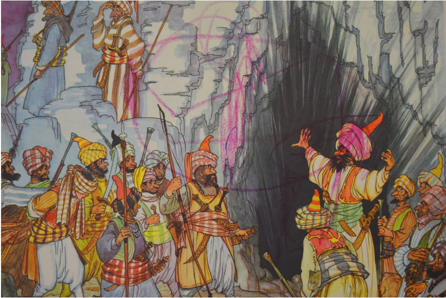
Fig. 3 Circle movements (Rhein and Petersen 1960, unpag.; Göttingen Collection S 22a 28)