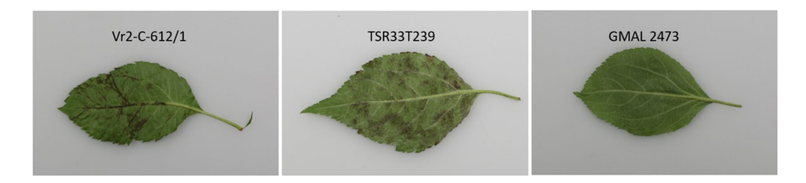
Fig. 2 Inoculation results of the Vr2-C transgenic line 612/1, TSR33T239, and GMAL 2473 with the scab isolate 1634 28 dpi. Vr2-C-612/1 and TSR33T239 show strong apple scab sporulation while GMAL 2473 did not show any symptoms

74 Page 8 of 11 Mol Breeding (2023) 43:74