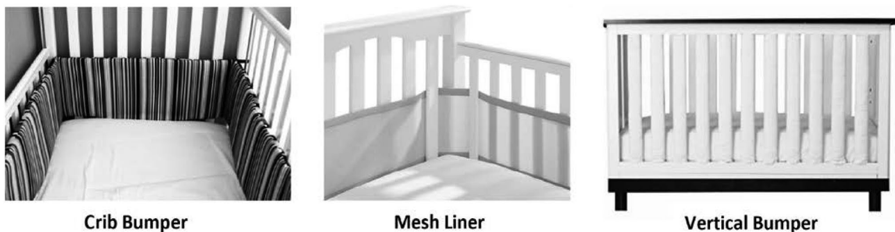
Fig. 1 Three types of crib barrier

Subscribers were offered an incentive to respond to our web survey's email link by entering a lottery for one of ten $100 Amazon gift cards. Five pilot tests with different email subject lines and instructions for 100 randomly selected P&N subscribers found no significant differences in response rates. After three follow-up emails, 12,332 emails were opened and 4070 (33%) were responded to (AAPOR 2016). Inclusion criteria resulted in 1344 eligible respondents who were mothers of singleton infants/toddlers, \leq 24 months old (Yeh et al. 2011), sleeping in cribs (Scheers et al. 2003) using a crib bumper (CB), mesh liner