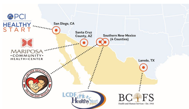
Fig. 1 Map of Healthy Start Border Alliance sites

The female population in the border region is younger than the overall U.S. population (23% under 15 years in 2007 vs. 19.4% of the U.S.), and are more than twice as likely to live under the federal poverty level (18.8 vs. 8.8%; U.S. Department of Health and Human Services [DHHS] 2009). They have higher fertility rates, higher rates of adolescent and teen pregnancy and late prenatal care (McDonald et al.