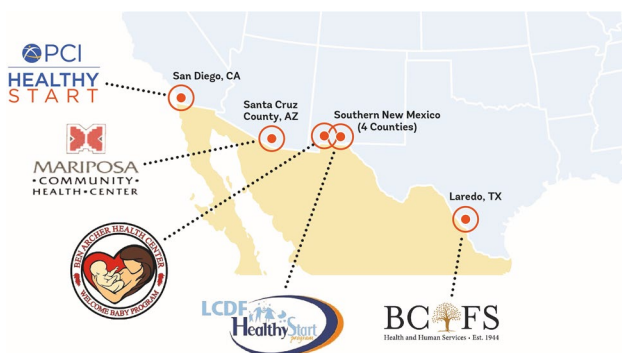
Fig. 1 Map of Healthy Start Border Alliance sites

Although the differences were not significant, Healthy Start participants had higher rates of FTPNC (95 vs. 91%), lower rates of late or no PNC (5 vs. 9%), were less likely to have sought any PNC in Mexico (6 vs. 10%). In addition, a